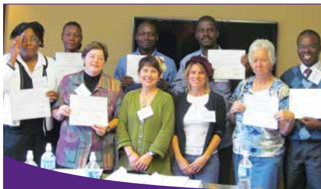
Peer-leaders trained in September 2012

"I was happy to take the Chronic Disease Self-Management Training and the Peer-leader Training in French. These workshops really contributed to my personal and professional development. I believe that this type of initiative should be made available to the francophone community more frequently in the Greater Toronto Area."