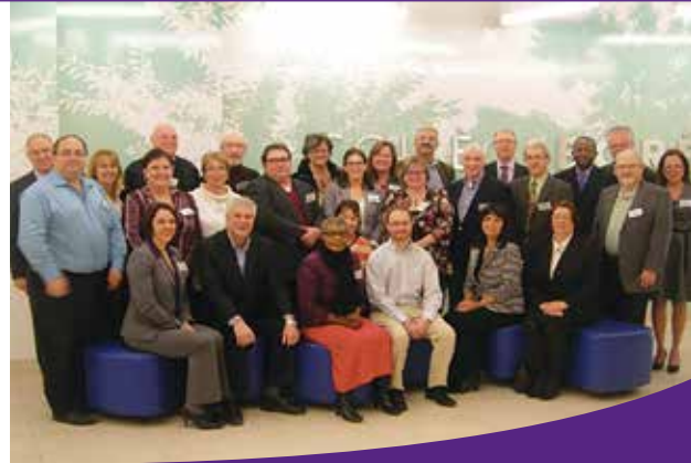
Board Members and Executive Directors of the Regroupement des Entités and the Alliance des Réseaux

We will continue to play an active role within the Regroupement and will continue to foster collaboration between l'Alliance des réseaux and other relevant provincial partners involved in the health of Francophones.