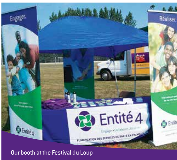
Our booth at the Festival du Loup

Entité 4 established relationships with members of the community and francophone organizations by being present where the francophone community gathers.