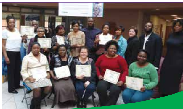
A group of participants with some of the organizers of the workshops held in March 2013

Initially, it was important to develop capacity to deliver these workshops by training volunteers (peer-leaders) who themselves live with a chronic condition. Thanks to the sustained efforts of Central-East Community Care Access Centre (CCAC) , South Georgian Bay Community Health Centre (CHC) , Centre de santé communautaire CHIGAMIK Community Health Centre and Southlake Regional Health Centre , the Peer-leader Training took place in September 2012. Seven Francophones successfully completed the program with the required knowledge and capabilities to start offering the Living a Healthy Life with Chronic Conditions workshop in various locations throughout our territory during 2013.