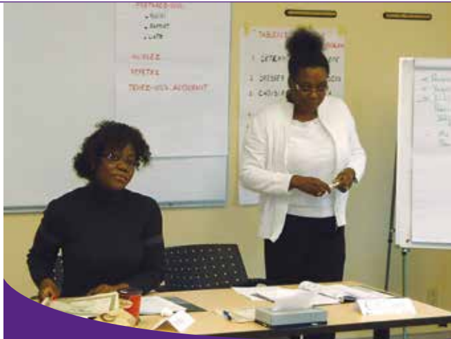
The peer-leaders trained in 2012 facilitate the workshops in March 2013

"I was personally enlightened by techniques so simple to use to help living with a chronic illness. The experiences of other participants really impressed me and I was very touched to learn that there are people like me whose life includes intense daily pain. I would appreciate Entité 4's contribution to offering these workshops on a regular basis in the francophone community because many of us live with such conditions without knowing how to manage them."