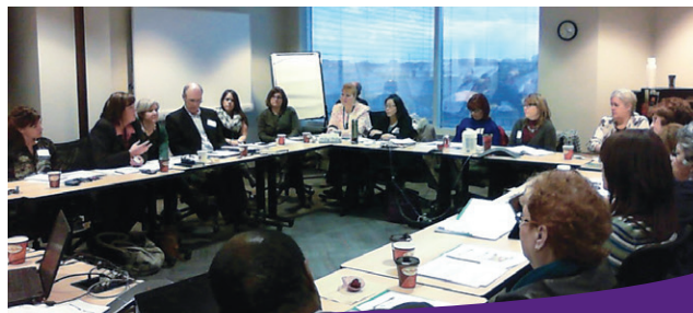
Lunch & Share, January 2014

Moreover, Entité 4's Planning Agents maintain a continuous dialogue with the LHINs' French Language Services Coordinators about joint projects, as well as liaise with the project leads in each LHIN .