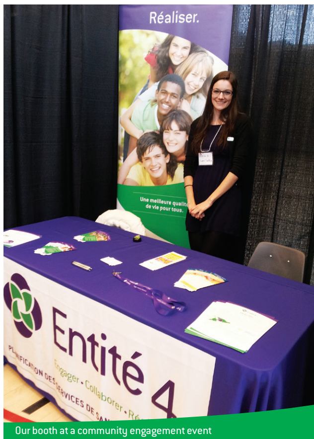
Our booth at a community engagement event

Collaboration between the Central-East LHIN, Entité 4 and Taibu Community Health Centre led to the creation of the Coalition for Healthy Francophone Communities of Scarborough . Their activities are primarily centered on prevention and promotion, specifically chronic disease self-management, mental health and maintaining a healthy lifestyle.