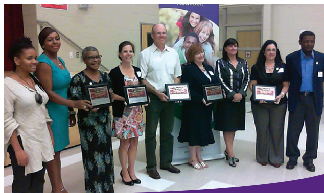
Recipients of the Recognition Awards presented at the Annual General Meeting

At the 2013 Annual General Meeting, Recognition Awards were presented to organizations which worked closely with Entité 4 to improve access to French language services and demonstrated exceptional commitment to this mission.