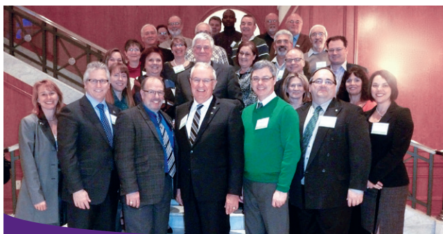
Members of the governing boards and executive directors of the Regroupement des entités and the Alliance des Réseaux

Entité 4 will only be able to fulfill its mandate by establishing a close collaborative relationship with key stakeholders in the health system: its LHINs and health service providers.