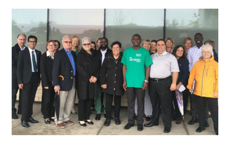
Participants at the Franco-Ontarian flag raising event in Durham