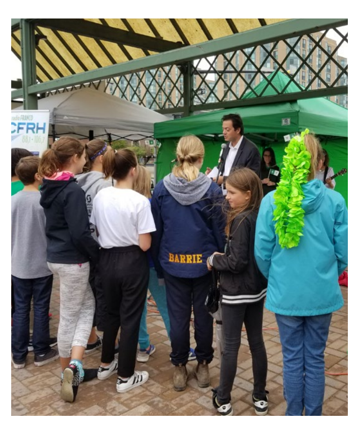
Entité 4 taking part in raising the Franco-Ontarian flag in Barrie