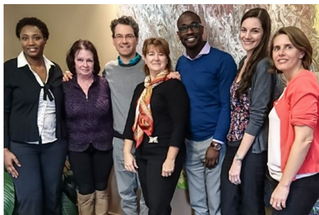
Entité 4 Team

This year, Entité 4 joined palliative care planning tables at each partner LHIN to ensure Francophone needs are identified during the planning phase.