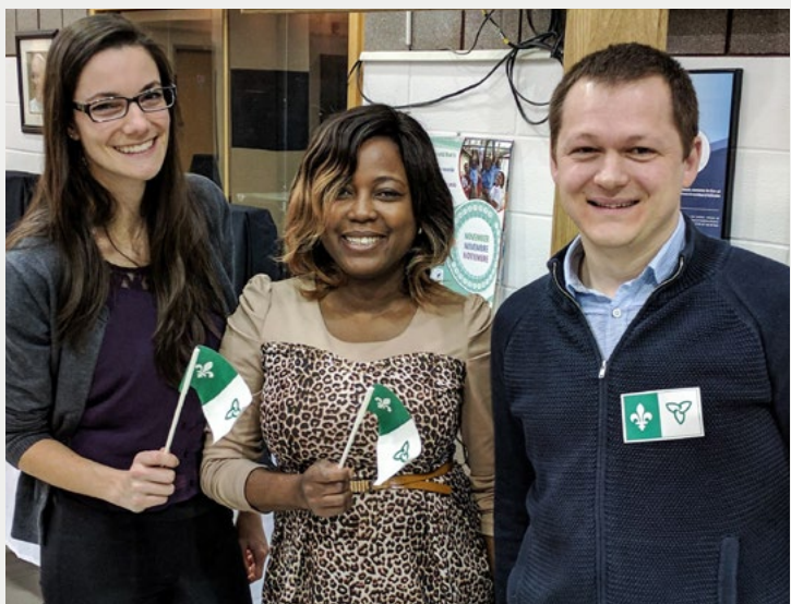
Representants of Entité 4, Colibri and YMCA at ÉSC Nouvelle-Alliance

SUSTAINING the offer of services by identifying and designating health service providers to offer French language services.