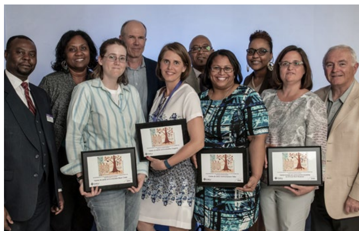
Recognition Awards recipients at the 2016 AGM

12 RECOMMENDATIONS TO NORTH SIMCOE MUSKOKA LHIN