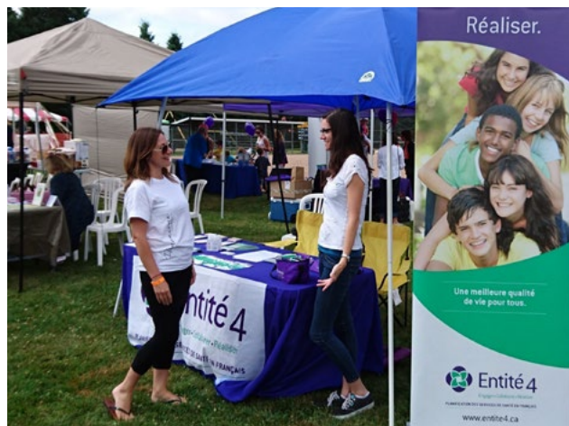
Entité 4's booth at the Festival du Loup in La Fontaine

Apart from school and community events, Entité 4 participated in the Festival du Loup in La Fontaine, attended the Foire de la francophonie organized by AFRY, had a booth at the Official Languages Open House in CFB Borden and spoke to the Francophone community in Scarborough at Kay Créole's Family Day event.