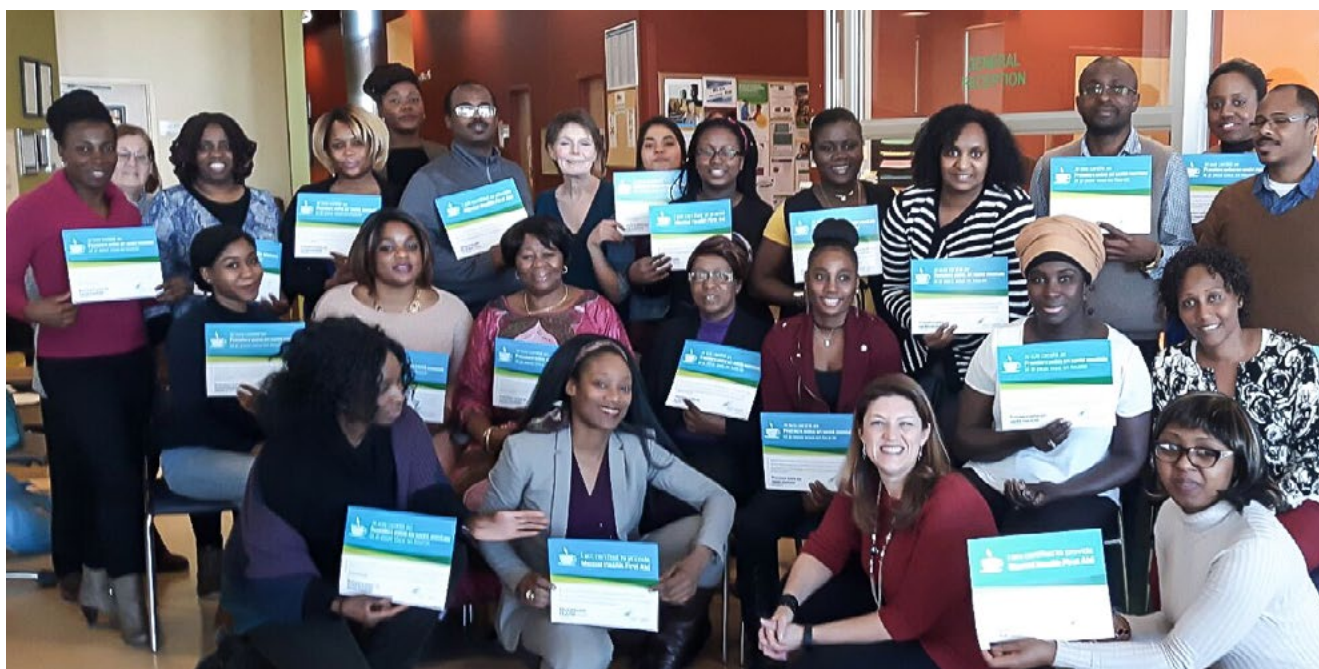
Participants and facilitators of Mental Health First Aid Program in French at TAIBU CHC