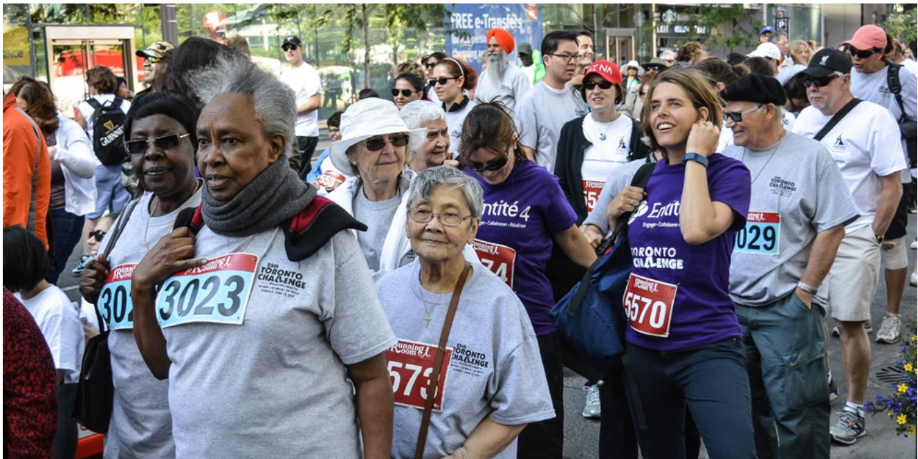
Francophone clients of Centres d'Accueil Héritage at the Toronto Challenge

A Steering Committee at Bendale Acres Long Term Care Home has been working to build French language services capacity and to promote services offered to increase bed occupancy. As of March 31st, there were 22 Francophone residents at Pavillon Omer Deslauriers of Bendale Acres Long-Term Care Home where services are offered in French.